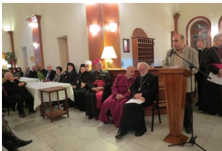
Reception at St. Margaret's, Nazareth