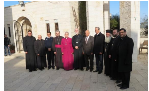
Archbishop at St. Matthew's, Zababdeh