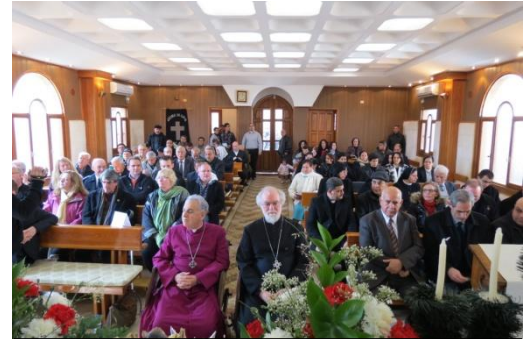
Sunday Service at St. Matthew's, Zababdeh

The Archbishop of Canterbury arrived on pilgrimage on January 27 th . Here with a small group of clergy and laity, the Archbishop began his pilgrimage in the Galilee. He also met with the local and regional clergy, heads of churches and a number of important civil leaders at St. Margaret's Guest House in Nazareth.